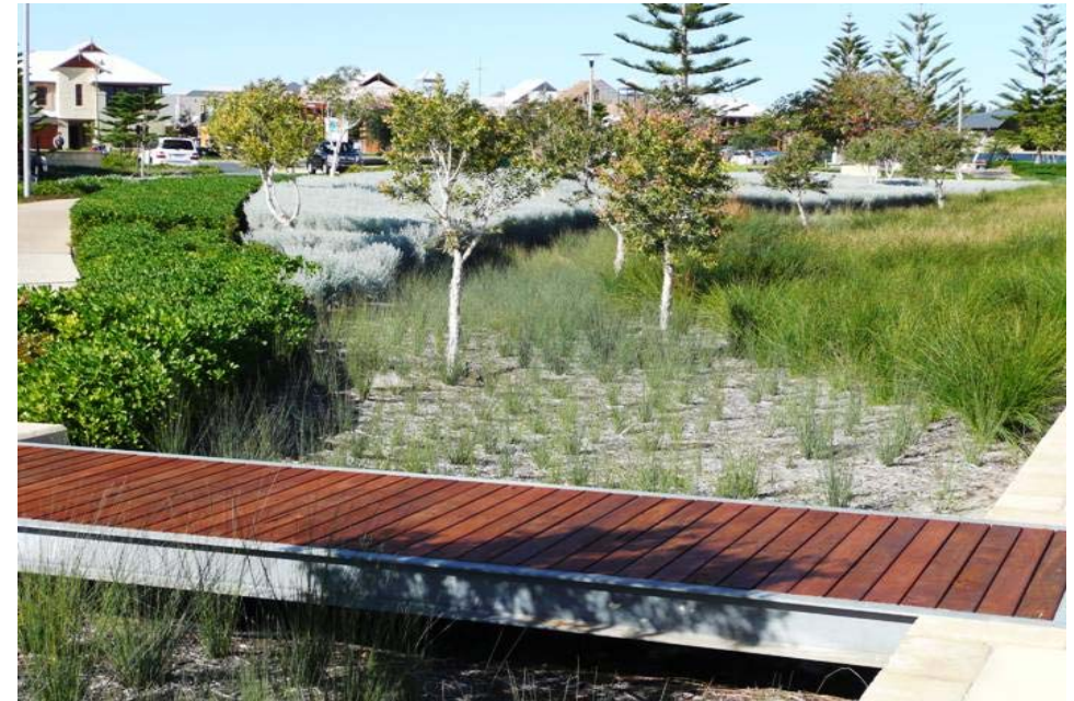
South Beach, South Fremantle, Stockland